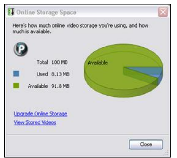
to view stored videos online and purchase more online storage.

Use the Check Online Storage option to monitor the amount of storage space you are using and/or have available on your WiLife Online account. The Online Storage Space screen also gives you access